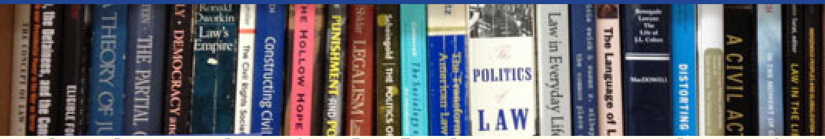
SPRING GRADUATION SPECIAL ISSUE PART TWO: CONGRATULATIONS TO OUR GRADUATES!